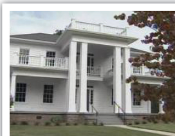
1 Dr. Victor R. Small House