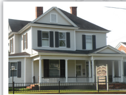
9 Peterson-Bethune House