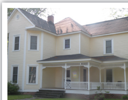
2 Jim McArthur House