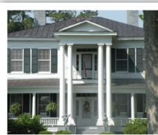
13 Amma Chestnut House