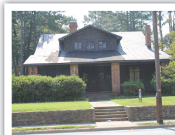
4 Clyde Carroll House