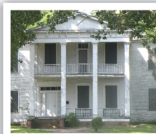
14 Alfred Johnson House