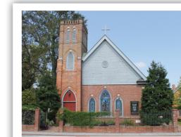
21 St. Pauls Episcopal Church