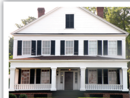
8 L.C. Graves House