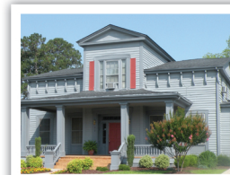
20 Dr. William G. Micks House