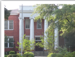
7 College St. School