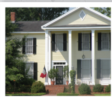
12 Warren Johnson House