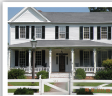
16 Richard Clinton Holmes House