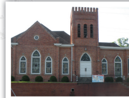
10 First Baptist Church