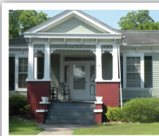
15 Matt Herring House