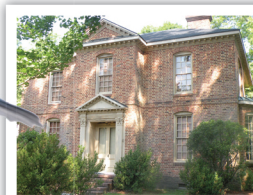
17 F.T. Atkins House