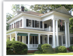
19 Allmond Holmes House