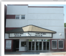
11 Sampson Comm. Theatre