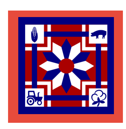
Pattern: "Circle of Opportunity"